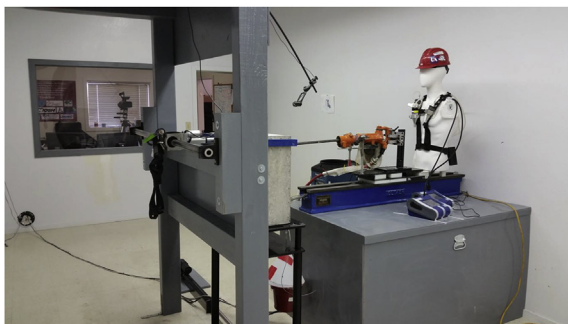
Fig. 1. The pneumatic drill mounted in the test bench system with rubber grips securing the handle and a Y mount supporting the drill near the bit. The drill mounting system slides on a lathe bed. After each hole is drilled actuators move the concrete block to a new location.

The electric rotary hammer drill used (Hilti TE-70 AVR; 8.3 kg; 46 Hz percussion frequency) is toward the high end of the weight range of electric drills. The pneumatic rock drill (American Pneumatic Tool, Model APT-115; 8.6 kg; 48 Hz percussion frequency) is toward the low end of the weight range of rock drills. For each study, the drills were fitted with new 19 mm diameter 2-carbide tipped bits of similar mass (Hilti TE-Y for the electric drill and Crowder WB77-750-14 for the pneumatic tool). The drills were held at the handle with a 4 fingered rubber lined mechanical gripper and supported at the chuck by a rubber lined Y fixture (Fig. 1).